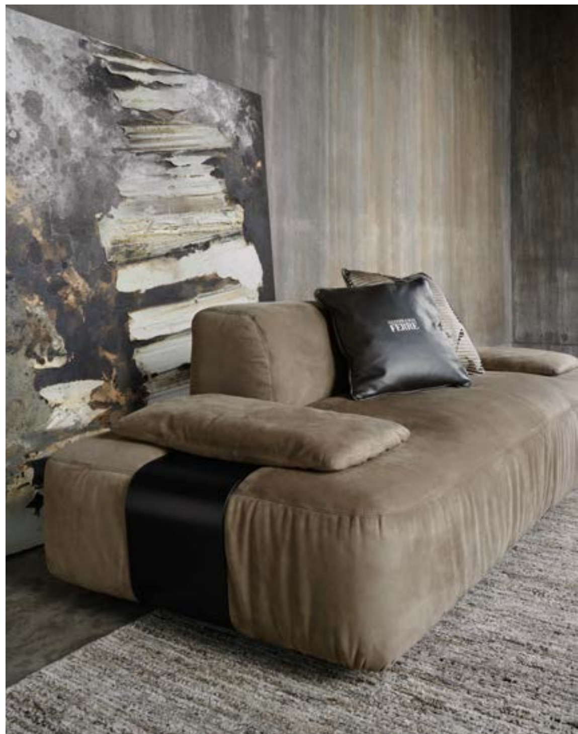
2-seater sofa SEATTLE armchair KALAMAJA low table DOPPLER