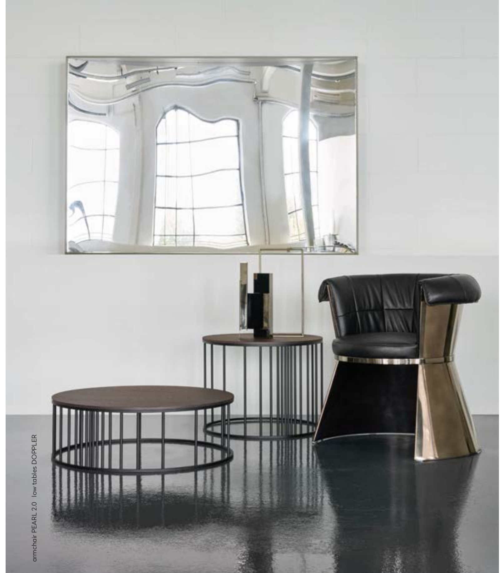
armchair PEARL 2.0 low tables DOPPLER