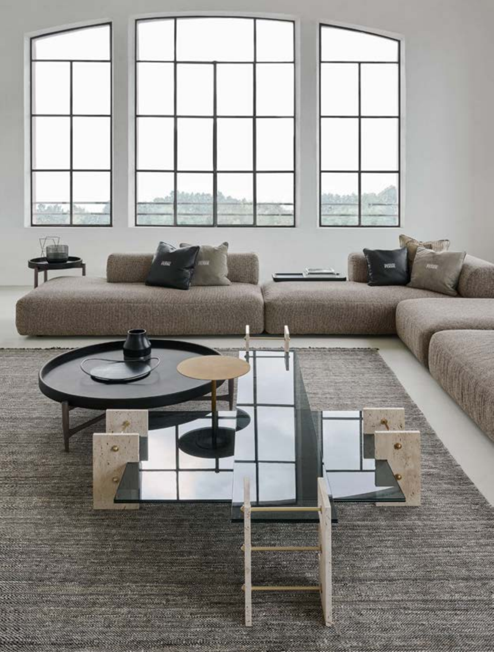
sectional sofa SEATTLE low tables FTZROY low tables CHAMBERS low table QUEENS