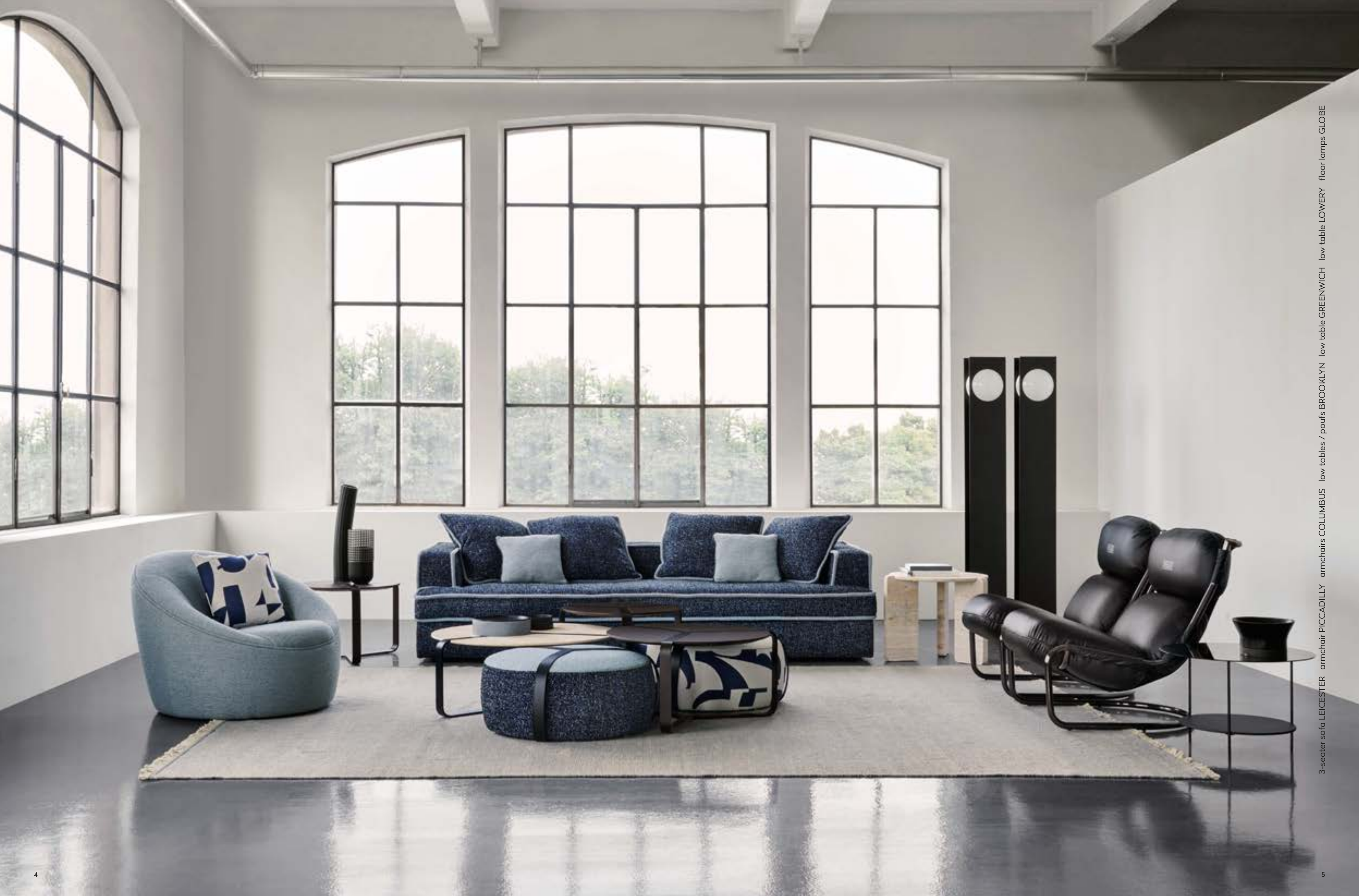
3-seater sofa LEICESTER armchair PICCADILLY armchairs COLUMBUS low tables / poufs BROOKLYN low table GREENWICH low table LOWERY floor lamps GLOBE