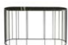
F.DOP.541.AQX L 150 D 40 H 85 cm L 59 D 15 3/4 H 33 1/2 in

Console with structure in metal with Black (matt) finishing. Top in marble cat. B Sahara Noir - Polyester Polished.