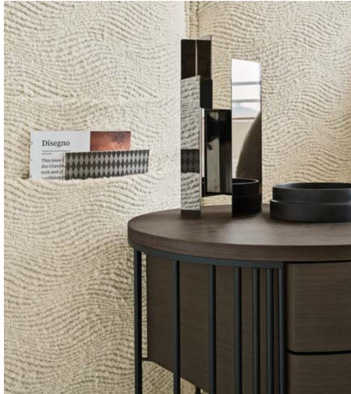
bed PMLICO night table DOPPLER