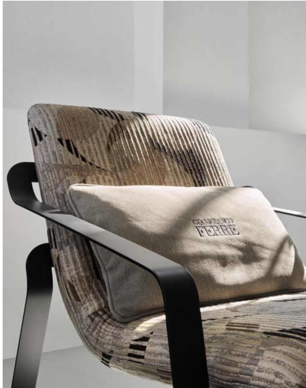
armchairs WALL STREET | low table QUEENS