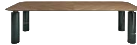
F.ROC.124.AQN L 300 D 120 H 78 cm L 118 D 47 H 30 3/4 in

Dining table with honeycomb top in solid fir wood and MDF. Internal reinforcement made of corrugated cardboard in rigid honeycomb and tubular iron. Upper part of the top in Canaletto Walnut Veneered finishing, with 4/4 inlay. Lower part of the top with matt Black Lacquered finishing. Iron spacers supporting the top in Black Chrome finishing. Legs in Sahara Noir marble.