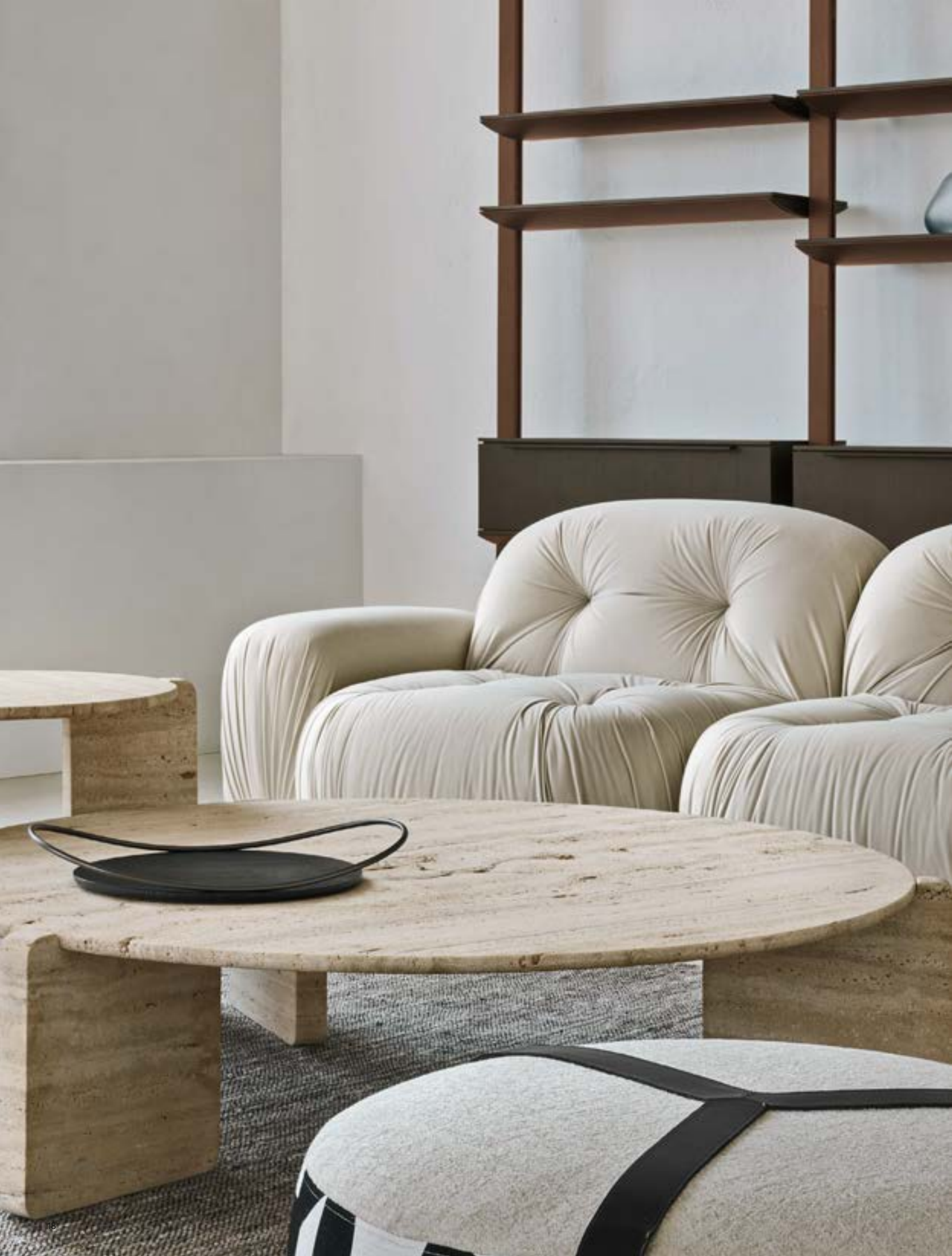
3-seater sofa BROMPTON armchair FULHAM pouf BROOKLYN low tables GREENWICH low table LOWERY modular bookcase HACKNEY