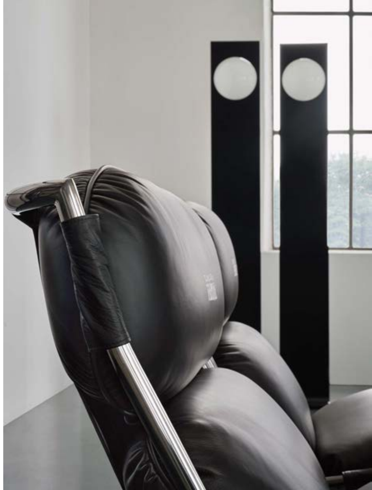
armchairs COLUMBUS | low table GREENWICH | low table LOWERY | floor lamps GLOBE