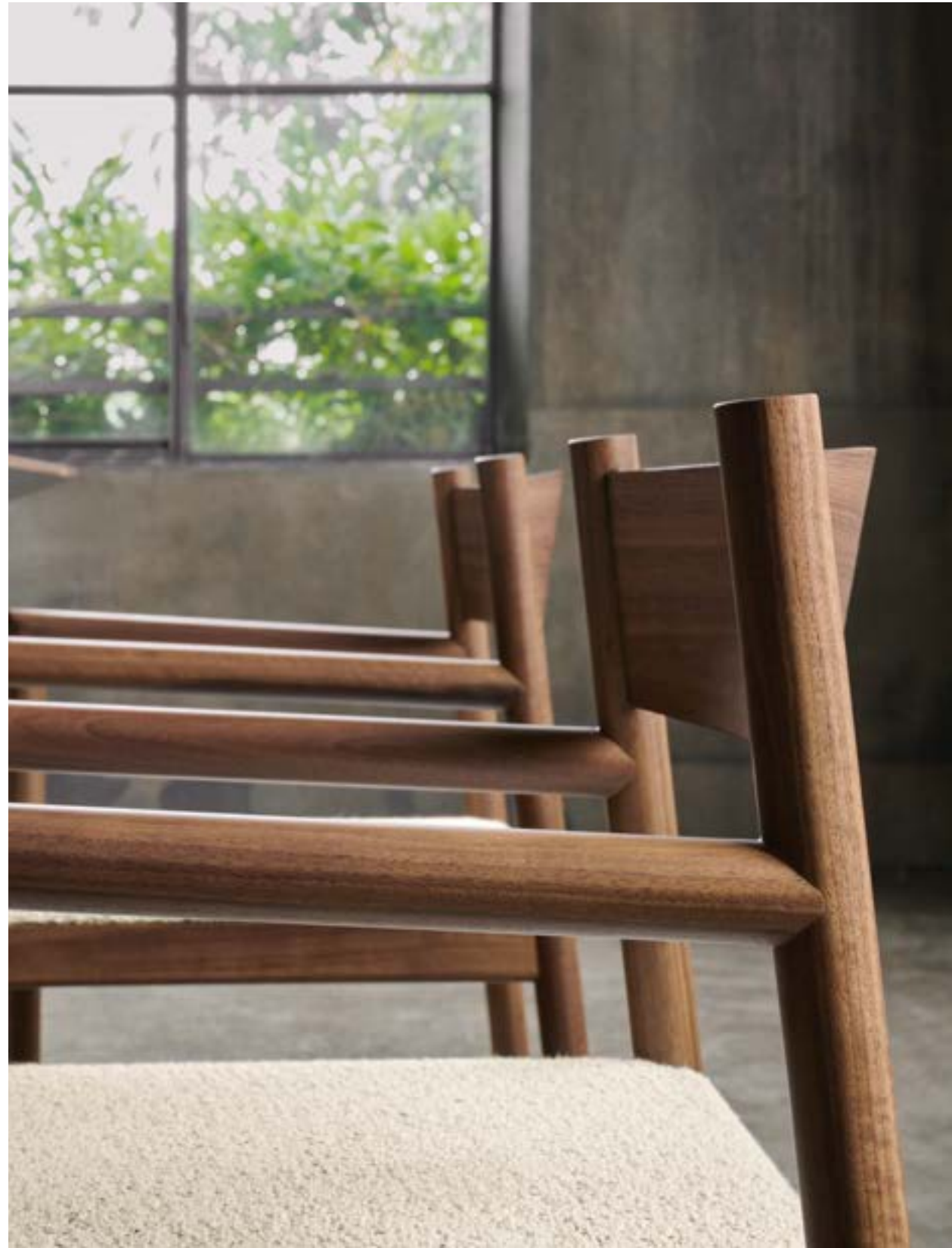
dining table ROCKEFELLER chairs DALSTON