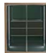
F.NOS.112.ASX L 120 D 52 H 150 cm L 94 1/4 D 20 1/2 H 31 1/2 in

Showcase with structure in multilayer wood with Canaletto Walnut Veneered finishing, assembled at 45° with 25 x 10 mm tubular insert in aluminium varnished with Black Chrome finishing, with retractable handles and pins. Doors in 8 mm thick smoked tempered glass. Handles in aluminium with Black Chrome finishing. Backrest in multilayer wood. Internal covering in bronzed mirror and back in anthracite microfibre. Internal lighting system with activation through motion sensor located on the left side of the base controlling the switching on of natural LED lighting. Base in matt Black Lacquered multilayer wood.