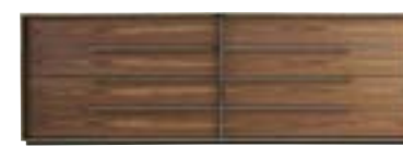
F.NOS.114.ASX L 240 D 52 H 80 cm L 94 1/4 D 20 1/2 H 31 1/2 in

Sideboard with structure in multilayer wood with Canaletto Walnut Veneered finishing, assembled at 45° with 25 x 10 mm tubular insert in aluminium varnished with Black Chrome finishing, with retractable handles and pins. Drawers in multilayer wood with Canaletto Walnut Veneered finishing. Drawer rails with soft closing. Handles in aluminium varnished with Black Chrome finishing. Back in multilayer wood, covered in anthracite microfibre. Base in matt Black Lacquered multilayer wood.