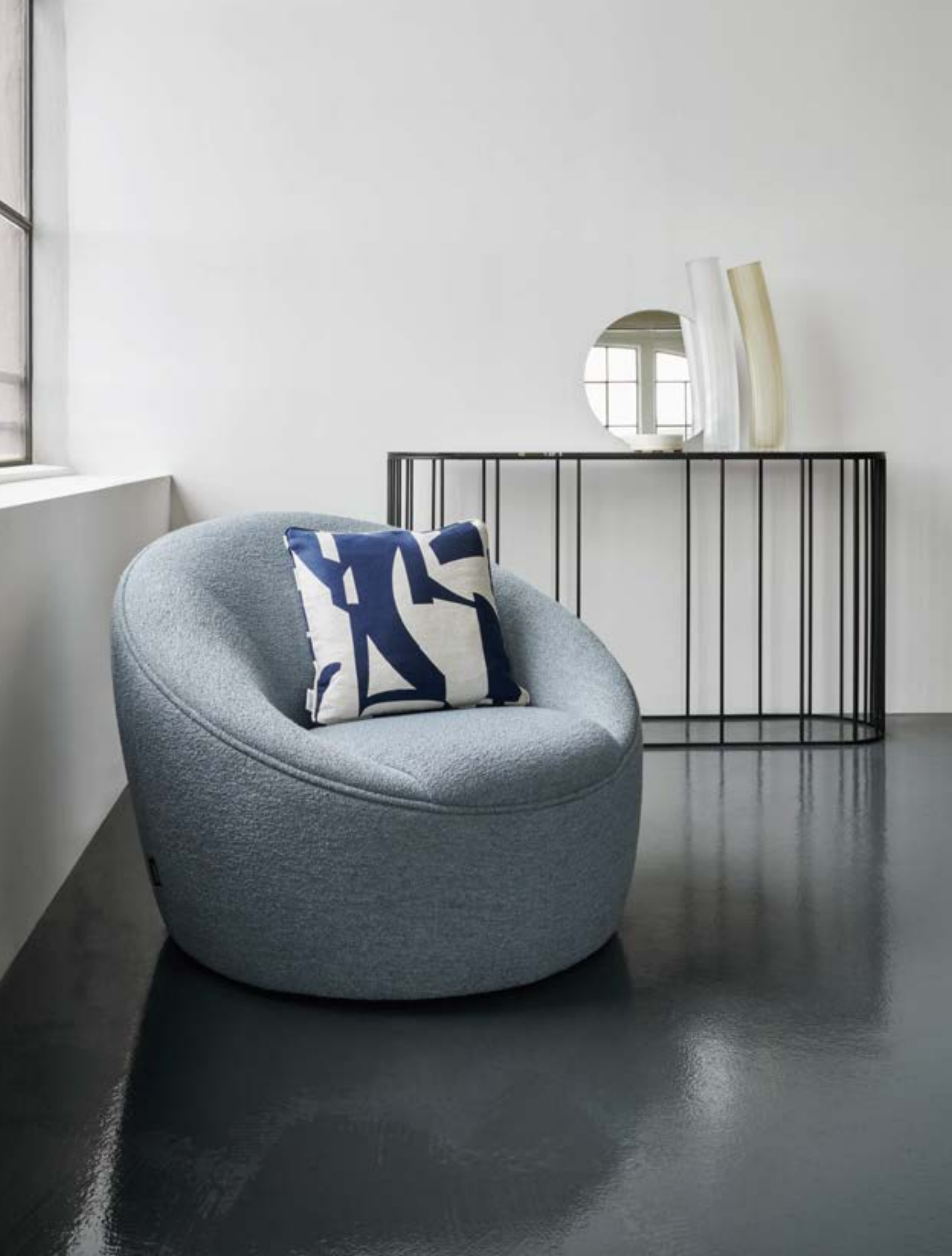
armchair PICCADILLY console DOPPLER table mirror MOON